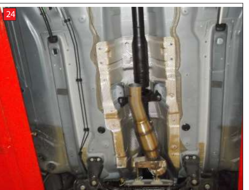
Remove transfer blanking plate. (item 8)