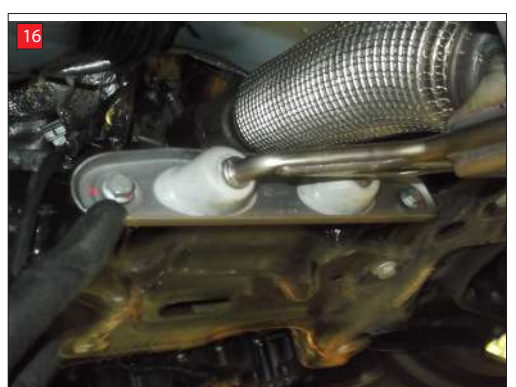
Remove Lambda sensor.

16) Remove lower catalyst mounting bracket.