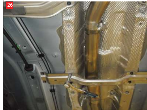
Re-fit lower propshaft cover then tighten up centre racket.