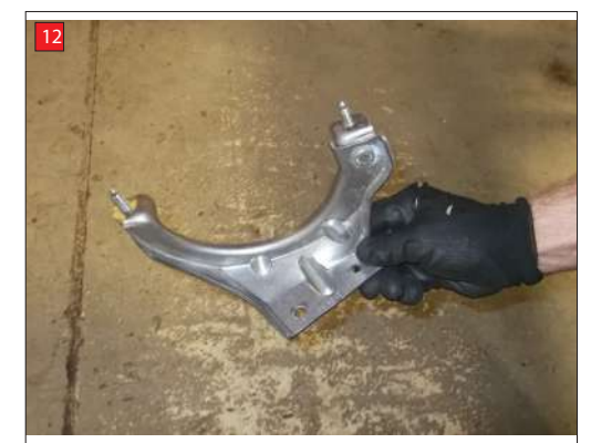
Bolt on transfer box cover plate (item 8) with (item 9) M8x12mm hex head bolts x 7.