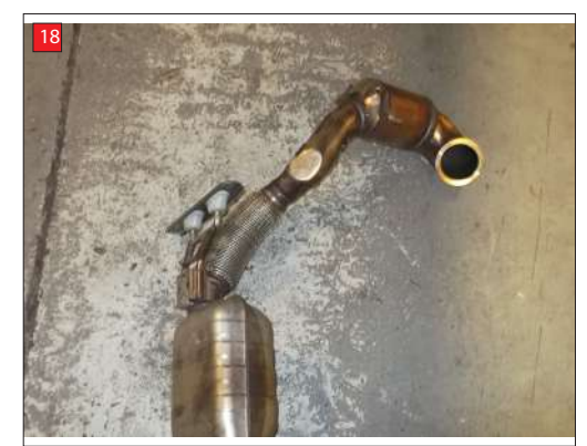
Undo turbo v-band clamp.