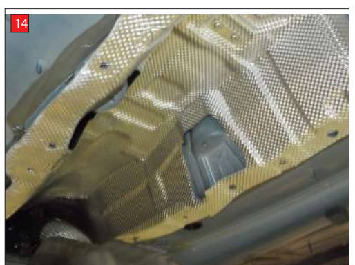
13) Unplug lambda at top of engine bay (this is a black connector)

14) Remove upper propshaft heat shielding.