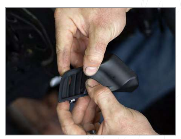
Press the clip into place on the defrost vent