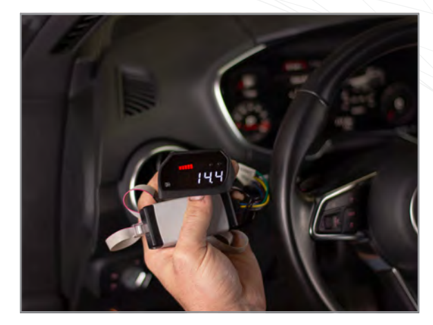
Plug the gauge into the vehicle's OBD2 port and start enginge to test functionality before installation