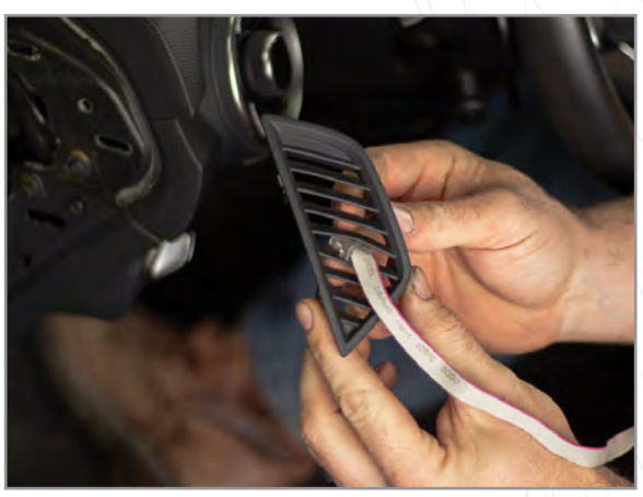
Push display cable through the 4th gap from bottom as shown

WARRANTY & LIABILITY: Neither P3 Cars, nor its dealers or agents shall be liable in any way, for any damage, loss, injury or other claims, resulting from the installation or use of this product. By purchasing or installing this product, you assume all liability of any kind connected with the use and/or application of this product. If you are unsure that you can safely install and use this product, consult a qualified installer or mechanic. The warranty on this product covers only the product itself for a period of 6 months from the date of purchase, and it will be at our discretion to repair or replace the affected parts. No user serviceable parts inside. Warranty will be voided if product shows physical damage.