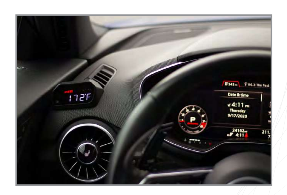
Your installation is now complete

WARRANTY & LIABILITY: Neither P3 Cars, nor its dealers or agents shall be liable in any way, for any damage, loss, injury or other claims, resulting from the installation or use of this product. By purchasing or installing this product, you assume all liability of any kind connected with the use and/or application of this product. If you are unsure that you can safely install and use this product, consult a qualified installer or mechanic. The warranty on this product covers only the product itself for a period of 6 months from the date of purchase, and it will be at our discretion to repair or replace the affected parts. No user serviceable parts inside. Warranty will be voided if product shows physical damage.