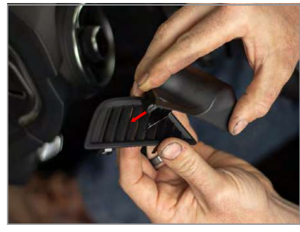
Insert clip into the 6th gap as shown

WARRANTY & LIABILITY: Neither P3 Cars, nor its dealers or agents shall be liable in any way, for any damage, loss, injury or other claims, resulting from the installation or use of this product. By purchasing or installing this product, you assume all liability of any kind connected with the use and/or application of this product. If you are unsure that you can safely install and use this product, consult a qualified installer or mechanic. The warranty on this product covers only the product itself for a period of 6 months from the date of purchase, and it will be at our discretion to repair or replace the affected parts. No user serviceable parts inside. Warranty will be voided if product shows physical damage.