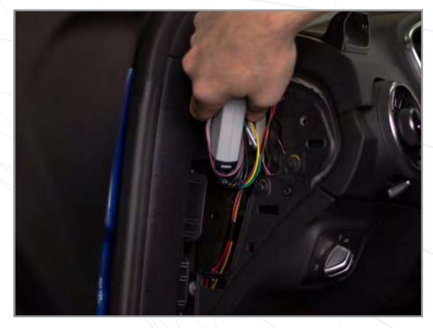
Tuck control box and wires into side dash