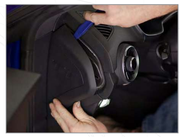
Use a trim pry tool to remove the panel on the driver's side of the dash.