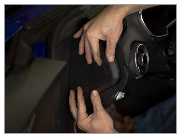
Replace side dash panel