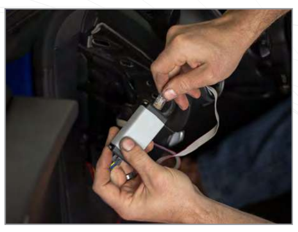
Connect both the display cable and the main harness to the control box

For additional install information please visit www.p3gauges.com/install