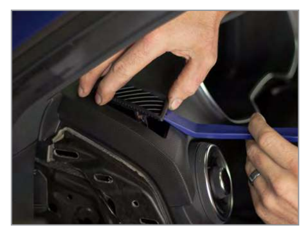
Use a trim pry tool to remove the defrost vent from the dash