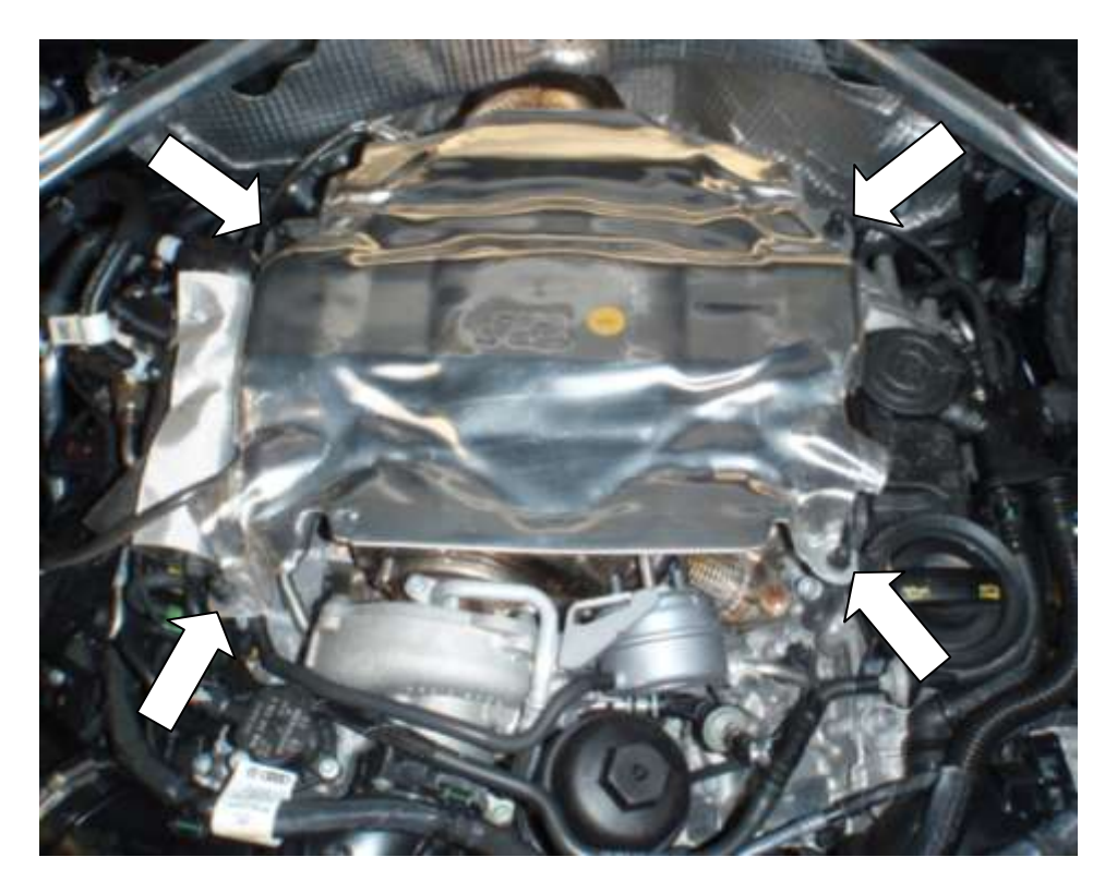
Engineered for performance

3. Using a 13mm spanner undo 4x engine cover mounts and remove the metal heat shield.